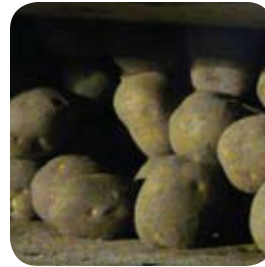
Sunrise Produce – Simcoe County

If you have a yearning for yogurt, this farm's for you. At Saugeen Country Dairy, the owners operate both a certified organic dairy farm and an on-farm dairy. It is the first on-farm dairy in Ontario to make and sell organic yogurt, which it has been doing since 1994. This yogurt has a short list of ingredients with all the milk produced on the farm. And it has been profitable. After 14 years of steady sales growth they process more than 300,000 litres and employ three full-time and five part-time staff.