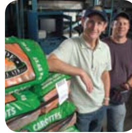
Hillside Gardens Limited – Simcoe County

Have you tasted the ‘orange of the north’? Sea Buckthorn is a multipurpose, citrus-type berry used in functional foods and for a variety of medicinal, agronomic and environmental purposes. The fruit is a source of omega 3, 6 and 9 oils and just eight berries provide the daily requirement of vitamin C and beta carotene. Sea Buckthorn can be grown in a wide range of soils, in greenhouses and is drought resistant. After six years of research and development, the growers are now selling cuttings to private and commercial sectors in Ontario and Quebec. These innovators have helped introduce the crop to Ontario and are continually working to educate consumers on its ‘berry-good’ merits.