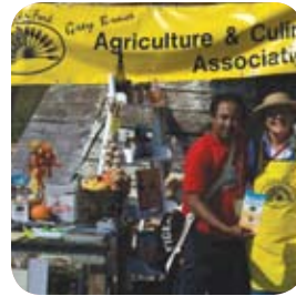
Grey Bruce Agriculture and Culinary Association – Grey and Bruce Counties

Forager Foods Inc. offers one-stop shopping with a local flavour. And it's looking to broaden support for Ontario agri-businesses by creating a network of similar stores across southwestern Ontario. With 21 local and regional food partners currently supplying products to a 900 square-foot retail food specialty store, customers can choose from an array of locally-produced foods. These include meats, deli, artisan cheeses, Lake Huron fish, prepared foods, fresh vegetables and pantry items. Most are grown from within 45 minutes or less of the storefront. The applicant's background as a chef helps consumers pair foods for an enjoyable and regional food experience.