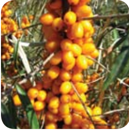
The Healing Arc Inc. & Everspring Farms Ltd. – Bruce County

Have you tasted the ‘orange of the north’? Sea Buckthorn is a multipurpose, citrus-type berry used in functional foods and for a variety of medicinal, agronomic and environmental purposes. The fruit is a source of omega 3, 6 and 9 oils and just eight berries provide the daily requirement of vitamin C and beta carotene. Sea Buckthorn can be grown in a wide range of soils, in greenhouses and is drought resistant. After six years of research and development, the growers are now selling cuttings to private and commercial sectors in Ontario and Quebec. These innovators have helped introduce the crop to Ontario and are continually working to educate consumers on its ‘berry-good’ merits.