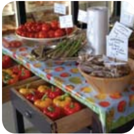
Forager Foods Inc. – Huron County

Forager Foods Inc. offers one-stop shopping with a local flavour. And it's looking to broaden support for Ontario agri-businesses by creating a network of similar stores across southwestern Ontario. With 21 local and regional food partners currently supplying products to a 900 square-foot retail food specialty store, customers can choose from an array of locally-produced foods. These include meats, deli, artisan cheeses, Lake Huron fish, prepared foods, fresh vegetables and pantry items. Most are grown from within 45 minutes or less of the storefront. The applicant's background as a chef helps consumers pair foods for an enjoyable and regional food experience.