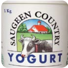
Saugeen Country Dairy – Grey County

If you have a yearning for yogurt, this farm's for you. At Saugeen Country Dairy, the owners operate both a certified organic dairy farm and an on-farm dairy. It is the first on-farm dairy in Ontario to make and sell organic yogurt, which it has been doing since 1994. This yogurt has a short list of ingredients with all the milk produced on the farm. And it has been profitable. After 14 years of steady sales growth they process more than 300,000 litres and employ three full-time and five part-time staff.