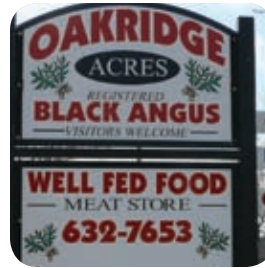
Oakridge Acres Country Meat Store – Waterloo Region

Thousands of Canadians suffer from life-threatening nut allergies and many schools ban peanut butter from the classroom. Consumers are demanding more peanut-free products. Hilton Soy Foods is answering the call. This innovator has created a soy product that tastes like peanut butter. Their product, Soy Butter, has won several taste tests and is being used by various manufacturers to develop new nut-free products. Caterers for children's camps and schools are also asking suppliers to carry this product. This innovation has benefited soybean farmers, created new jobs and market opportunities in the processing sector and offers peace of mind to consumers.