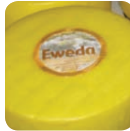
Best Baa Farm – Wellington County

Bert Fisher Farms has responded to a growing market demand for antibiotic-free chickens. In 2007, they began delivering 15,000 birds a week to a national grocer. That demand has since grown to 60,000 birds a week and the farm has filled the bill. Their innovative antibiotic-free management process has seen their birds' seven-day weights increase an average of 40-70 per cent, with some flocks attaining more than five times gain from placement weight. The business also built a commercial research facility and has conducted upwards of 50 trials which have helped to build on and fine-tune its success.