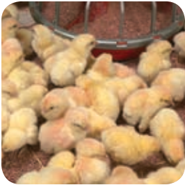
Bert Fisher Farms Limited – Perth County

Bert Fisher Farms has responded to a growing market demand for antibiotic-free chickens. In 2007, they began delivering 15,000 birds a week to a national grocer. That demand has since grown to 60,000 birds a week and the farm has filled the bill. Their innovative antibiotic-free management process has seen their birds' seven-day weights increase an average of 40-70 per cent, with some flocks attaining more than five times gain from placement weight. The business also built a commercial research facility and has conducted upwards of 50 trials which have helped to build on and fine-tune its success.