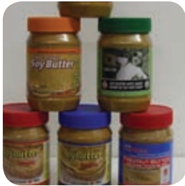
Hilton Soy Foods – Perth County

Thousands of Canadians suffer from life-threatening nut allergies and many schools ban peanut butter from the classroom. Consumers are demanding more peanut-free products. Hilton Soy Foods is answering the call. This innovator has created a soy product that tastes like peanut butter. Their product, Soy Butter, has won several taste tests and is being used by various manufacturers to develop new nut-free products. Caterers for children's camps and schools are also asking suppliers to carry this product. This innovation has benefited soybean farmers, created new jobs and market opportunities in the processing sector and offers peace of mind to consumers.