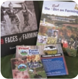
Ontario Farm Animal Council – Wellington County

Do you want “the real dirt on farming”? The Ontario Farm Animal Council offers a booklet under the same name, just one of the many creative materials it has developed over the past 20 years to promote agricultural awareness. The Council continuously finds innovative ways to tell the story of Ontario’s farmers. Almost 100,000 visitors have accessed its “Virtual Farm Tours” with a click of their computer mouse. People also enjoy the “Faces of Farming” calendar, sold out each year. The non-profit education organization is a leader in developing resources and participating in events that help educate and raise awareness of Ontario’s agri-food sector.