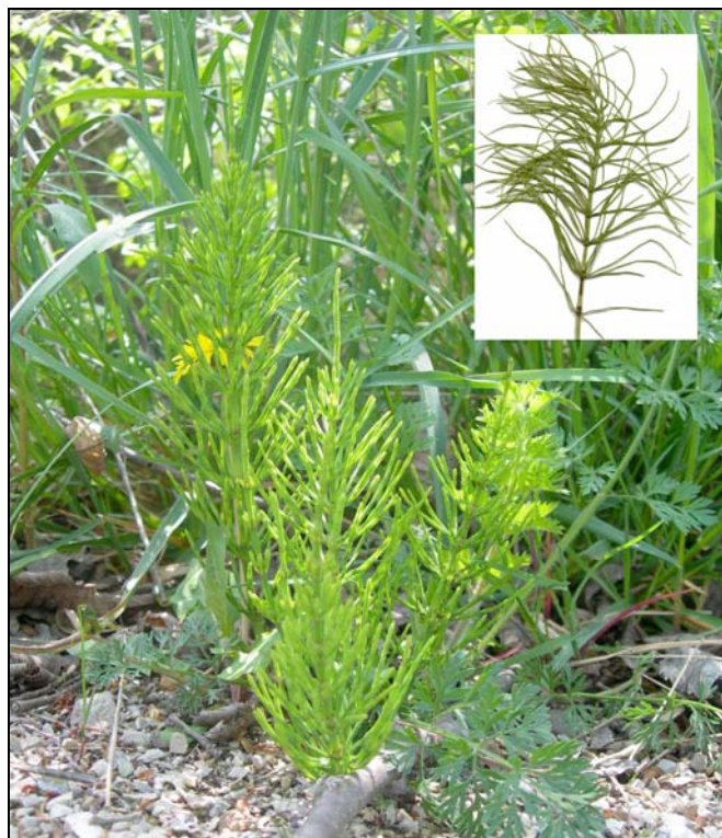
Figure 1. Sterile stem of Equisetum arvense

Present and persistent since the Paleozoic era (250–540 million years ago), the plants of the genus Equisetum , commonly known as horsetail, are considered to be living fossils. These widespread, perennial, fern-like plants are found in most temperate areas of the world. They can have detrimental effects on horses if consumed in large quantities (e.g., 2 kg (4–5 lb) per day for a 454-kg (1,000-lb) horse, for 1–2 weeks).