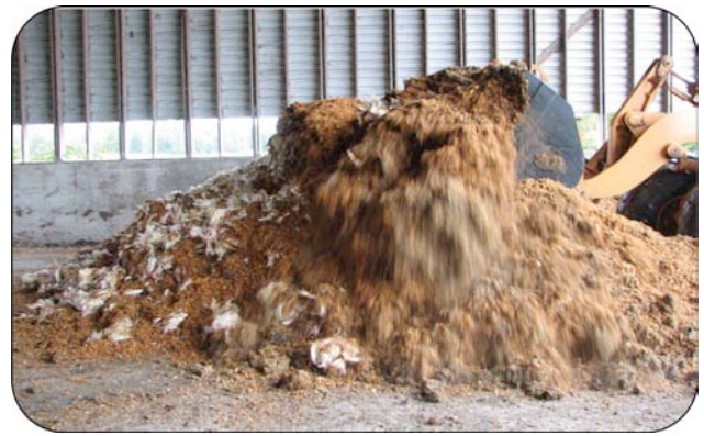
Figure 2. Turning a composting pile consisting of dead poultry mixed with substrate.

There are areas of the province where no collection service is offered, and there are some species of livestock that are not picked up in some areas of the province. Compare the costs of collection to the operational and management costs of on-farm disposal.