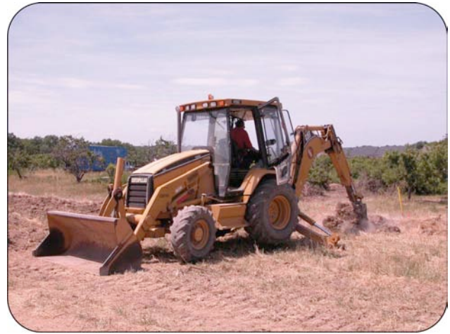
Figure 8. Digging a burial pit using a backhoe.

Under the new regulation, standards for burial pits have been expanded to protect ground- and surface water and prevent scavenging. The new standards require that deadstock placed in a burial pit be covered with a least 0.6 m of soil at all times while the burial pit is open (Figure 8). Burial is not permitted in areas where the bottom of the burial pit is less than 0.9 m above bedrock or an aquifer.