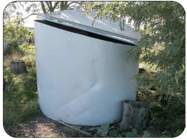
Figure 5. In-vessel composting system.