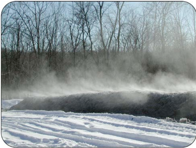
Figure 4. Windrow composting system.

There are several different methods of composting, including a three-bin system (Figure 3), windrow composting, which is more suited to planned culls, (Figure 4) and in-vessel (Figure 5).