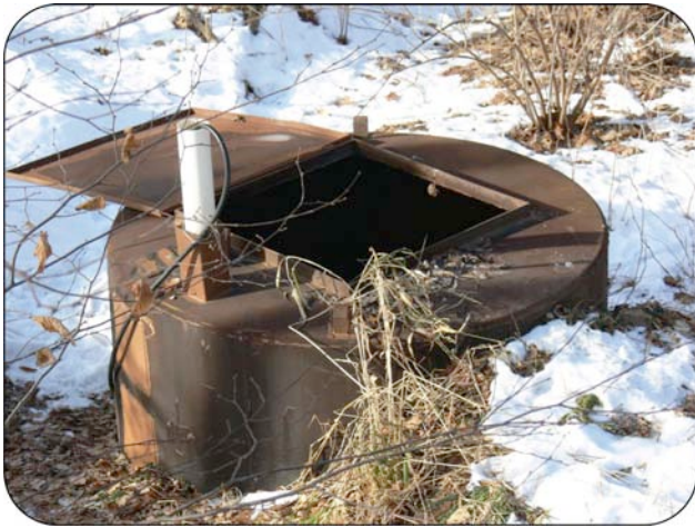
Figure 7. In-ground disposal vessel, with vent pipe and open hatch.