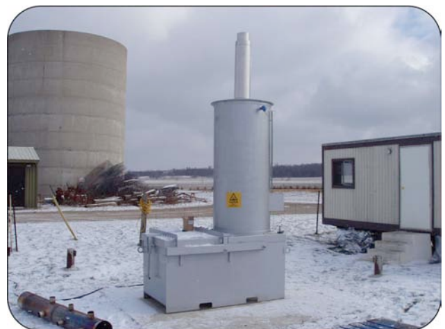
Figure 6. Incinerator with a secondary chamber.

Incinerators are a viable option for the disposal of smaller species. Incinerators used for deadstock disposal must have a Verification Certificate issued by the Environmental Technology Verification Program (ETV Canada), certifying that it has a secondary chamber that is capable of maintaining the gases that enter it from the primary chamber at 1,000°C or higher for at least 1 second, or 850°C or higher for at least 2 seconds. High temperatures in the secondary chamber will decrease the contaminants in the emissions. Figure 6 shows an example of a commercially available unit.