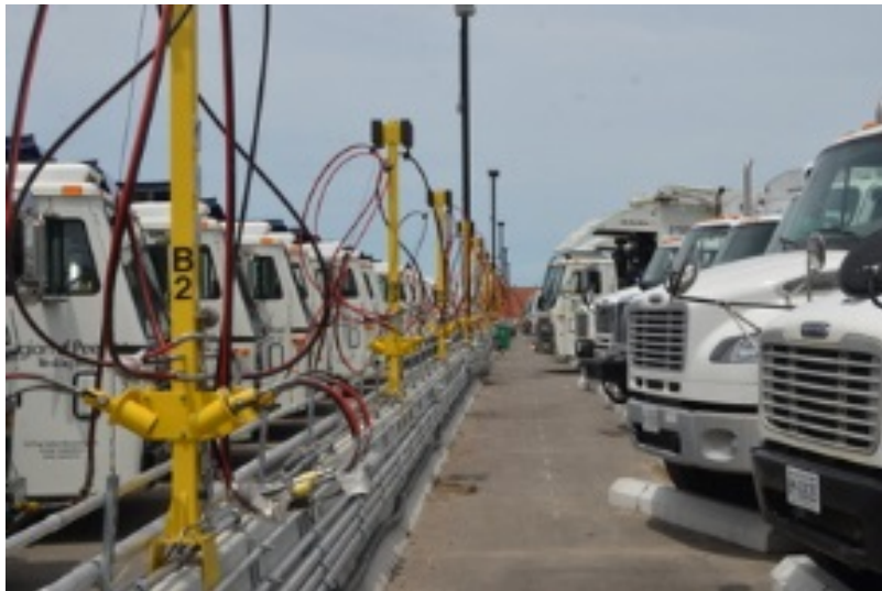
Figure 2. An Emterra compressed natural gas refuelling facility in Mississauga with many overnight slow-fill stations.

Generally, RNG is similar to conventional fossil natural gas and can be used in commercially available natural gas vehicle engines. Currently, the primary market in Canada for natural gas engines has been in transport trucks, garbage trucks, and buses. Figure 2 shows a natural gas refuelling site in Mississauga, Ontario. There are also Original Equipment Manufacturer (OEM) natural gas passenger cars and light duty trucks. After-market conversions can be installed in many diesel or gasoline engines, including off-road vehicles like agricultural or construction tractors.