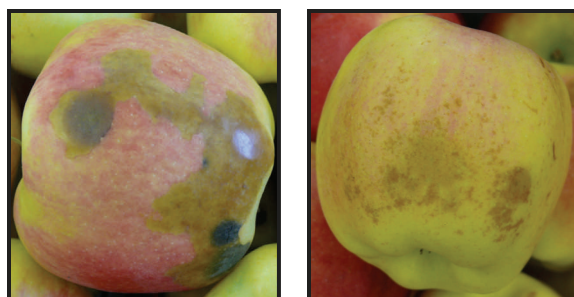
Photo 1: Soft scald with secondary rot (left) and hard skin bronzing (right) in “Ambrosia”