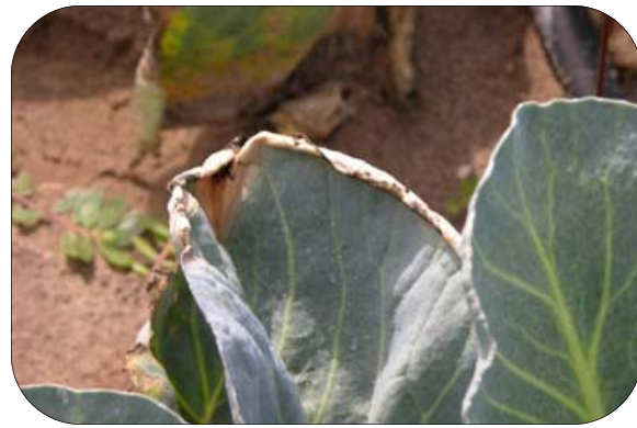
Figure 2: Leaf margins curl inwards

Symptoms: Symptoms often begin on lower, older leaves. Brown necrotic spots or chlorotic mottling develop near leaf tips and along margins (Figure 1). These necrotic areas can provide opportunities for disease infection. Leaves curl inwards (Figure 2). The margins become ragged, giving a “crinkle leaf” appearance. Lower leaves eventually die.