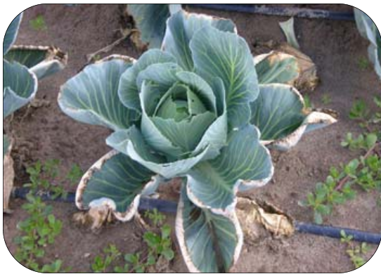
Figure 1: Mn toxicity symptoms begin in older leaves