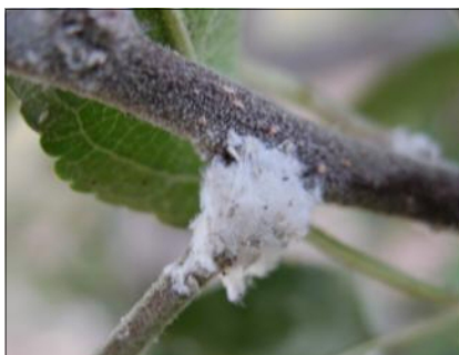
Figure 1 Woolly apple aphid colony on apple terminal

The WAA nymph passes through four instars, changing in size from 0.6 mm long to 1.3 mm long. The nymphs are dark reddish-brown with a bluish-white waxy covering that becomes more extensive in the later instars (Fig 1). This waxy coating help to protect the aphid from predators and pesticide sprays.