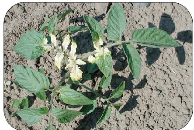
Figure 2. Glyphosate drift damage on a tomato plant.