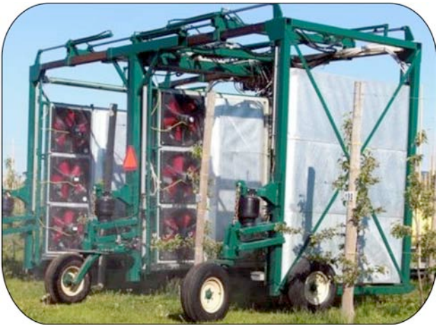
Figure 6. Recycling sprayer.