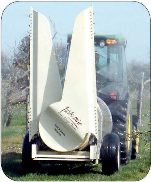
Figure 4. Airblast sprayer with towers.