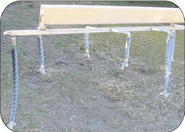
Figure 8. Drop-arms on a horizontal boom.