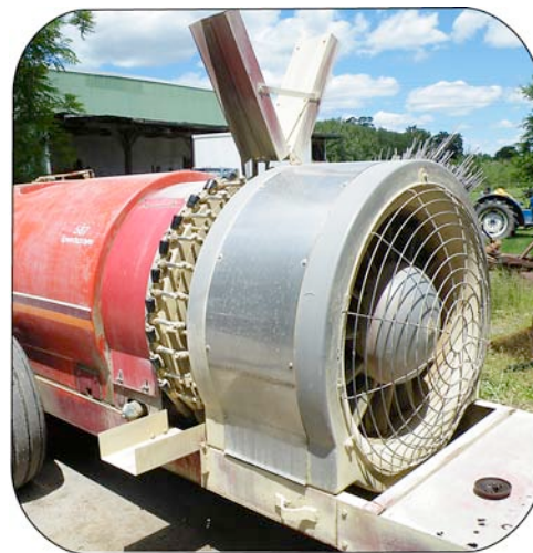
Figure 3. Airblast sprayer with deflectors.