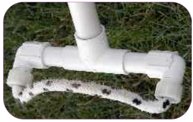
Figure 11. Rope-style wiper/wick system.