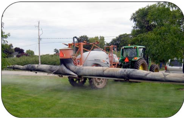
Figure 9. Air-assist sleeve on a horizontal boom.