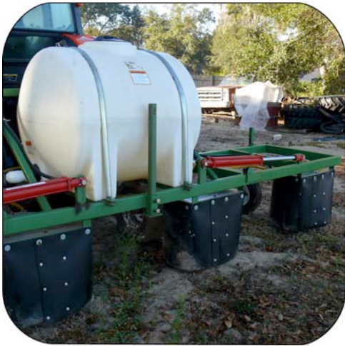
Figure 10. Shrouds on a horizontal boom.