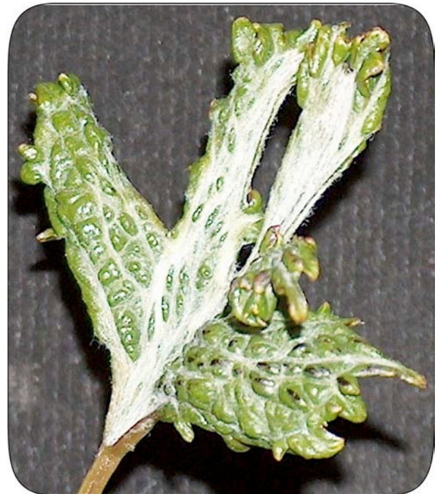
Figure 1. 2,4-D drift damage on grape leaves.

There are also legal responsibilities and liabilities associated with all these issues.