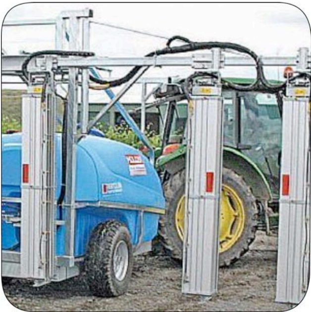
Figure 5. Tangential sprayer.