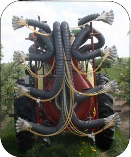
Figure 7. Laser-scanning sensor-controlled air assisted sprayer.